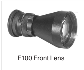
F100 Front Lens

The NVG-7 with F100 front lens can be used as a powerful night vision bi-ocular. To change the front lens unscrew the front lens off the body of the NVG-7 (make sure that the unit is turned off). Screw the F100 lens.