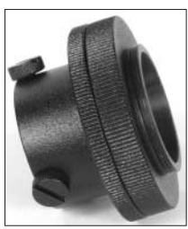
Camera adapter (optional)