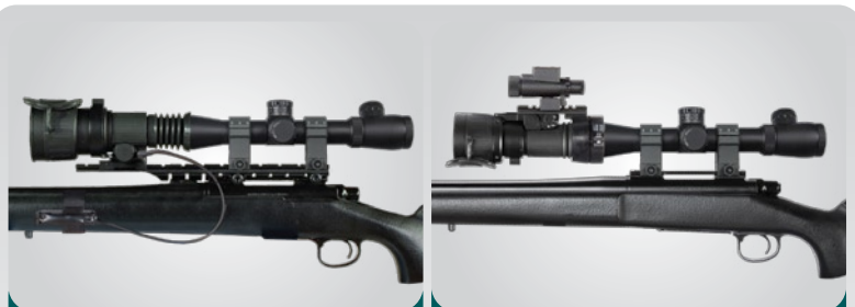
PS-40 INSTALLED ON MIL-STD-1913 RAIL FORWARD OF DAYSCOPE