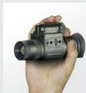
NVM14 Compact Monocular