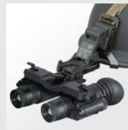
NVM14 with dual bridge