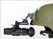
NVM14 with helmet mount