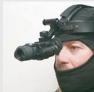
NVM14 with Goggle kit