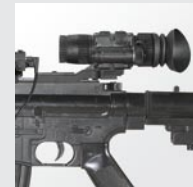
NVM14 with weapon mount