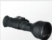
NVM14 with 3x lens