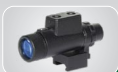
IR-450 Infra-red Illuminator

* Specifications are provided for informational purposes only. Actual values may vary