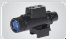
IR-450 Infra-red Illuminator

* Specifications are provided for informational purposes only. Actual values may vary