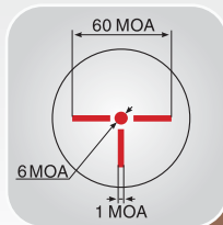
Post with Dot

Export Warning: These products are subject to one or more of the export control laws and regulations of the U.S. Government. Pending the model these products are under the control jurisdiction of either the US Department of State or the US Bureau of Industry and Security US Department of Commerce. Export without proper licensing or consent is strictly prohibited.