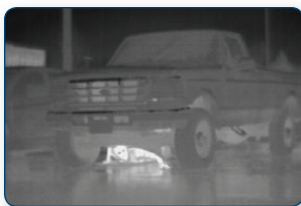
See through darkness