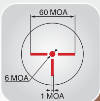
Post with Dot