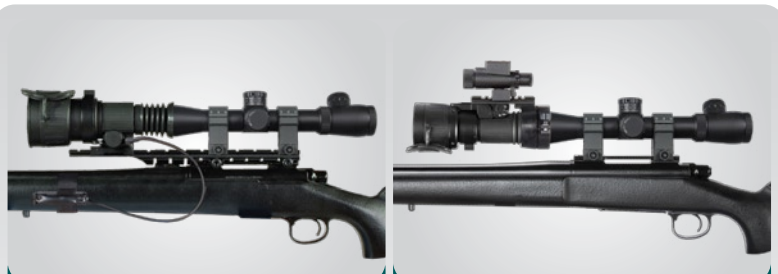
PS-40 INSTALLED ON MIL-STD-1913 RAIL FORWARD OF DAYSCOPE