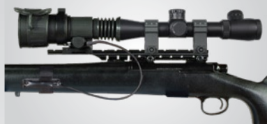
PS-40 INSTALLED ON MIL-STD-1913 RAIL FORWARD OF DAYSCOPE