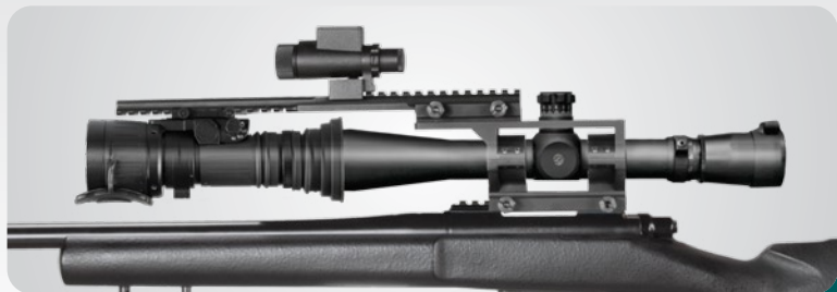
PS-40 INSTALLED ON B.A.M. system