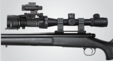
PS-40 INSTALLED ON DAYSCOPE OBJECTIVE LENS