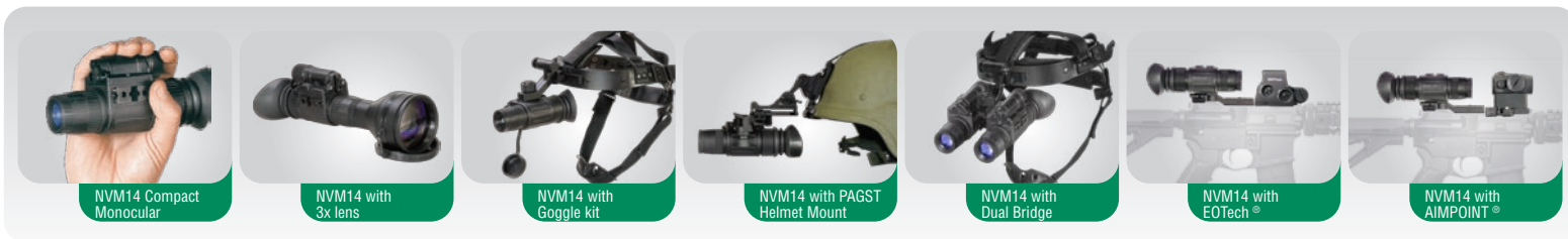
NVM14 Compact Monocular