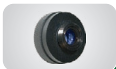
2X DOUBLER ACMUDBLR02