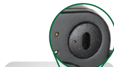
COMPUTERIZED PROXIMITY SENSOR