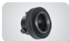
CAMERA ADAPTER ACMUCA02