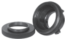
CAMERA ADAPTER CA4 Item #ACMUCA04