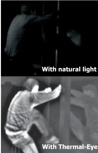
Breaking and entering

Selected #1 in image quality in recent independent surveys.